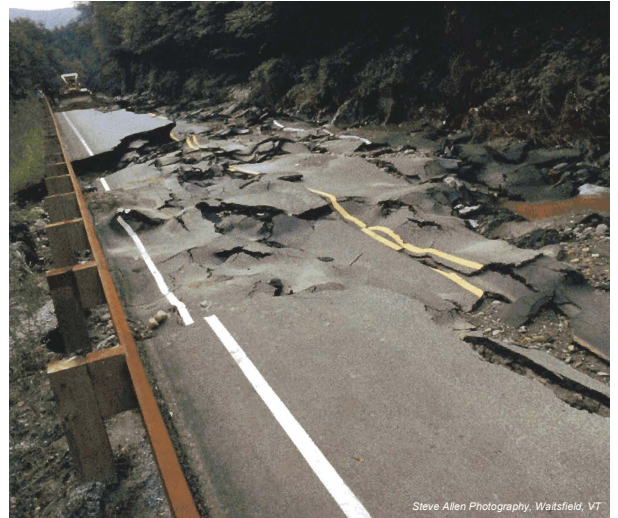
Road damage as a result of flash flooding.

When you approach a flooded road, TURN AROUND, DON'T DROWN!